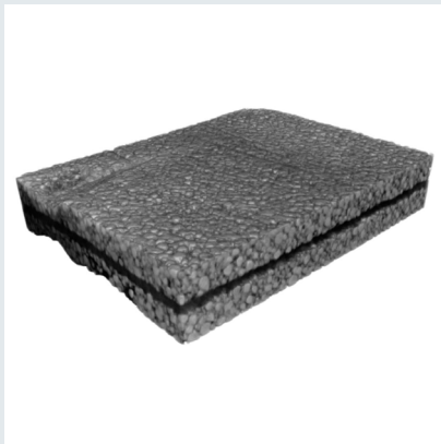
▲ Battery cathode foil imaged at 590 nm voxel resolution