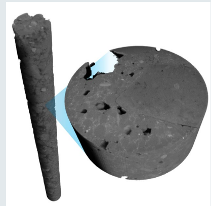
▲ 40 x 3 cm concrete core. 7 mm volume of interest scanned at 5 \mu\text{m} voxel size.